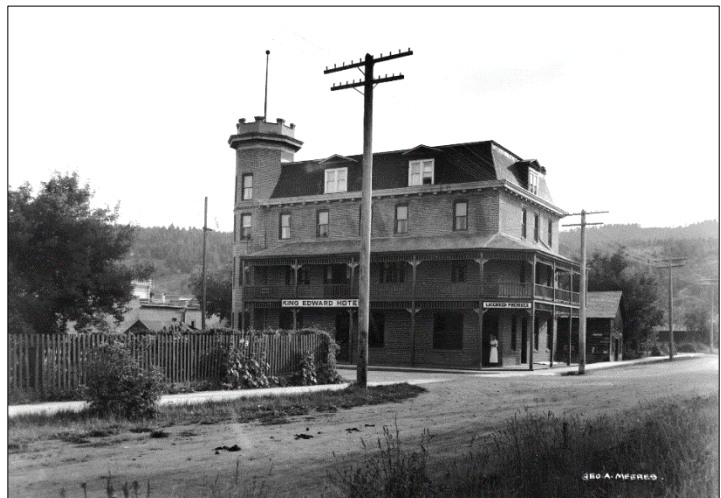
The King Edward Hotel, circa 1937.