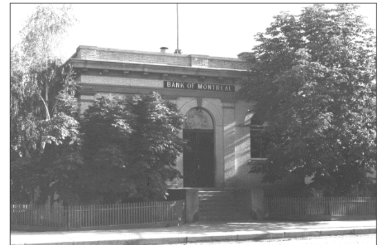
The Bank of Montreal in 1938. EDMS #1501

If you are in Salmon Arm during Heritage Week, check out our exhibit at Piccadilly Mall. This display features twenty of the heritage buildings in Enderby,